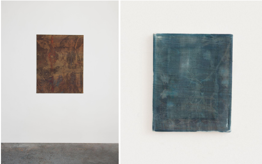
Left: Olga Grotova, Rot , Pigments and photograms on linen, 100 x 80 cm, 2023

Szelit Cheung explained, 'The residency is named 'Door To Door', and 'Door' is an interesting theme that is full of imagination. When standing in front of the door, you may choose to open it to exit or enter a new space, or even stay in the current state. At MLSAR, I was attracted to the light and atmosphere of the building. I often gaze at the light on the floor or on the walls to experience the atmosphere at different times. I try to express my interpretation in my work.'