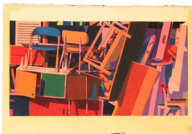
Zoer, School , Acrylic on Japanese paper, 32 x 47 cm, 2020, photo: Ian Cox, courtesy the artist and Schoeni Projects

Zoer's piece A Case Study of a House (2020), presents an anamorphic installation created through a 'barricade' of domestic objects and furniture stacked within the space. Highlighting both the reality and futility of partitions, the works symbolise the 'shield' of objects and material possessions used to evoke social or emotional 'distance' to others.