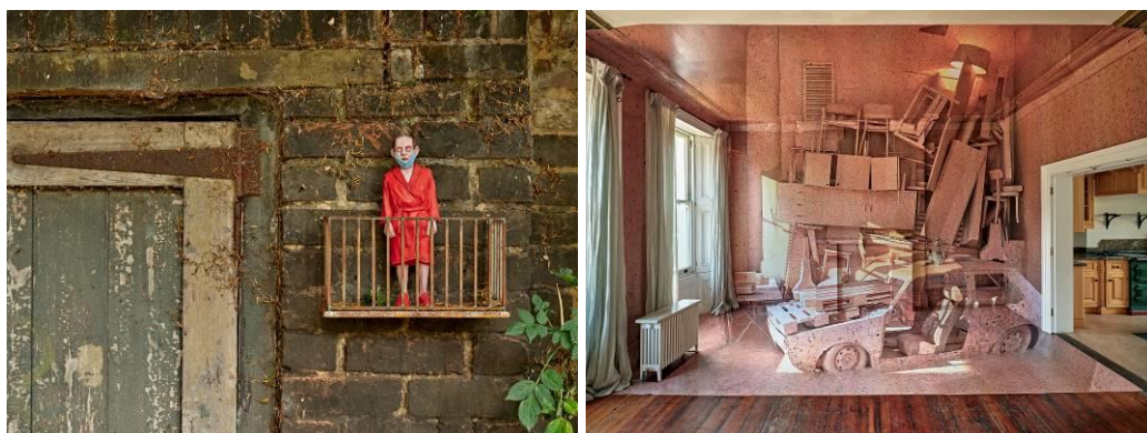
L-R: Isaac Cordal, Installation view disCONNECT at Schoeni Projects, London (2020); Zoer, Installation view disCONNECT at Schoeni Projects, London (2020); photos: Nick Smith, courtesy the artist and Schoeni Projects

Iranian born, Brooklyn-based, arts duo Icy & Sot's kitchen-based installation is modelled on a discarded table found within the unrenovated house. Titled Socialism vs Capitalism (2020), the folding table is now complete with two folding table places: the plates and cutlery split and hinged so they too move with the tabletop. The work reflects on the often-debilitating effects of capitalism on the poor, here represented through the most basic of human needs: food.